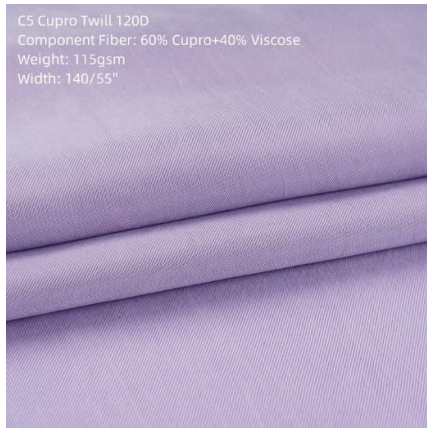
C5 Cupro Twill 120D Component Fiber: 60% Cupro+40% Viscose Weight: 115gsm Width: 140/55"