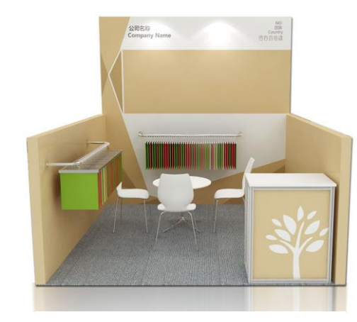
*Design layout for reference only