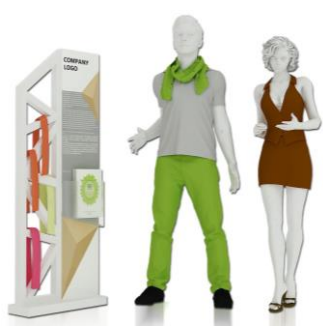
*Design layout for reference only